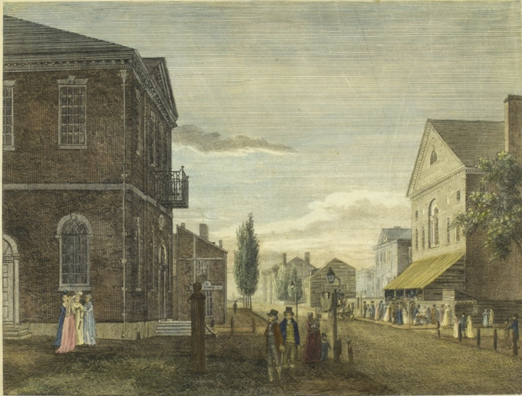
CONGRESS HALL and NEW THEATRE, in Chestnut Street PHILADELPHIA.