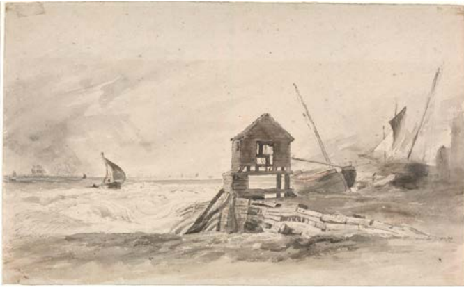
John Constable, Coast scene, Brighton (1824)

This special issue of Eighteenth-Century Studies has 2 intersecting goals: (1) to reflect on what a recent “coastal turn” in ecocriticism, critical geography, and related fields might contribute to eighteenth-century studies; (2) to examine the ways that eighteenth-century coastal geographies (real and imagined) have informed the aesthetics, politics, and lived experiences of coasts around the world, especially, though far from exclusively, in settler-colonial contexts. An inherently interdisciplinary field, coastal studies combines the geography of coastal environments with a historical, literary, and cultural understanding of how peoples and cultures move across, within, and between littoral zones. Such studies regard coasts as locales of contact or friction between oceanic and terrestrial ecologies where systems devised to mark and delimit the space of human habitation and knowledge are barraged by forces of entropy and reformation and thus provide significant sites of resiliency and resistance. In this respect, coastal studies also provides opportunities to operate at the limits of and interstices between disciplines and to reflect on how the frictions between them might change the disciplines themselves.